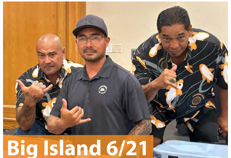
Big Island 6/21